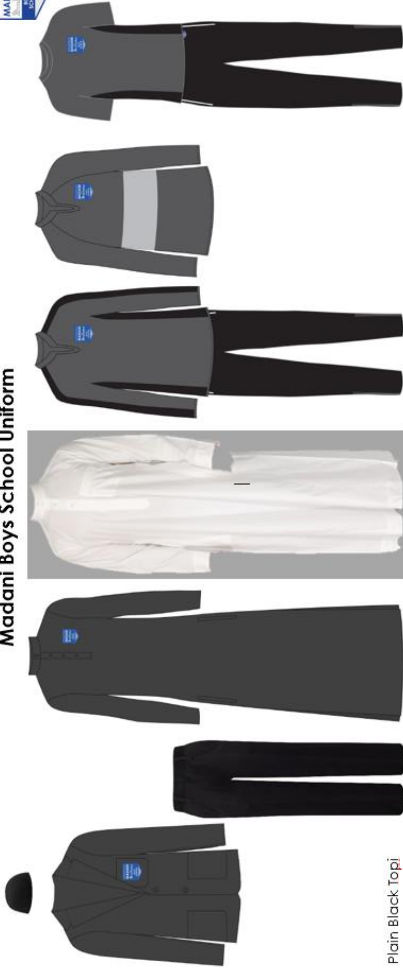
Plain Black Topi