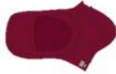
Burgundy Headscarf (School Branded)