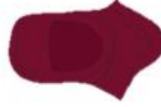
Burgundy Sports Headscarf